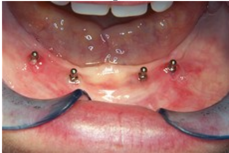
4 Mini Implants to stabilize lower denture