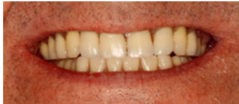
Completed dentures attached to mini implants.