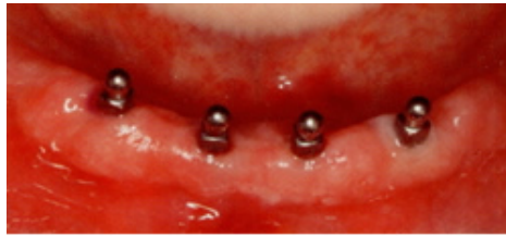
Mini implant posts immediately after placement in lower jaw.