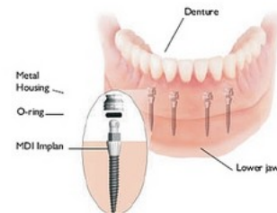
Mini Dental Implants

The Mini Dental Implant System consists of a miniature titanium implant, or screw that acts like the root of your tooth and a retaining fixture that is incorporated into the base of your denture. The head of the implant is shaped like a ball and the retaining fixture acts like a socket that contains a rubber O-ring. The O-ring snaps over the ball when the denture is seated and holds the denture at a predetermined level of force. When seated, the denture gently rests on the gum tissue. The implant fixtures allow for micro-mobility while withstanding natural lifting forces.