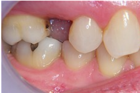
Mini Dental Implant and Crown