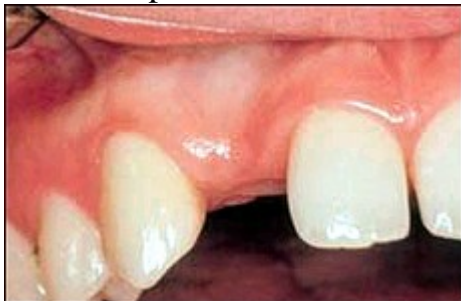
Dental Implant to replace missing Lateral Incisor